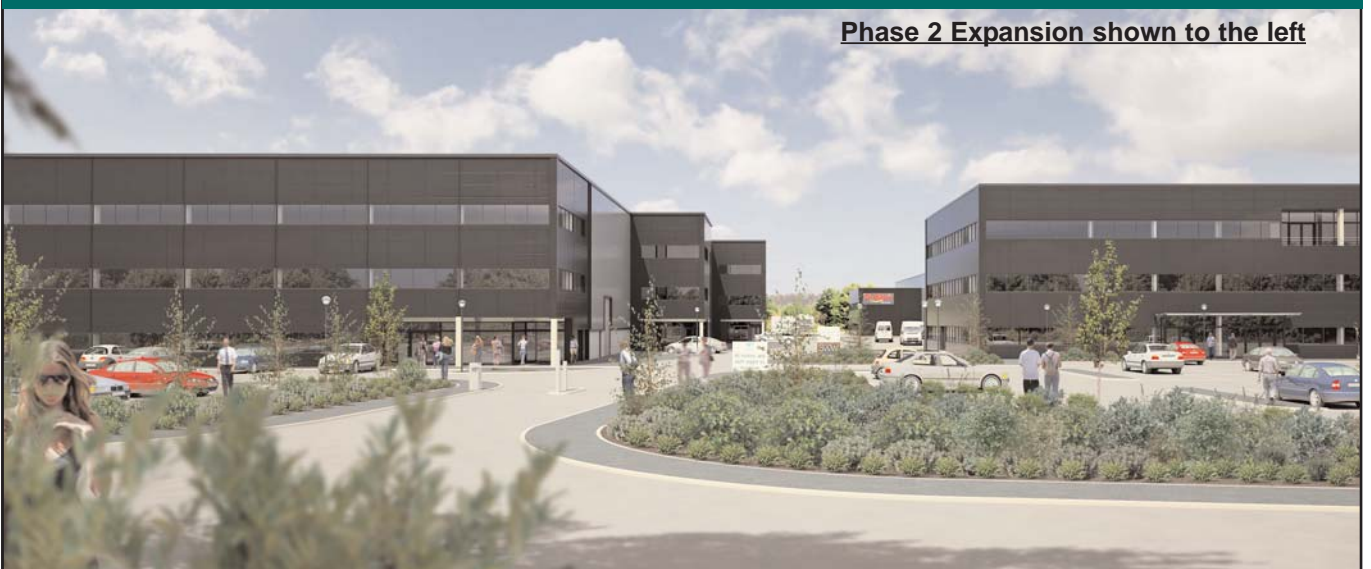
Phase 2 Expansion shown to the left