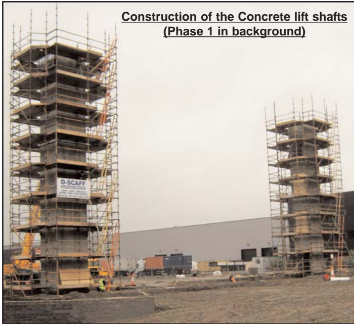
Construction of the Concrete lift shafts (Phase 1 in background)

Accommodation Provided: 55,640 sq. ft. of warehouse accommodation and 22,952 sq.ft. of office accommodation.